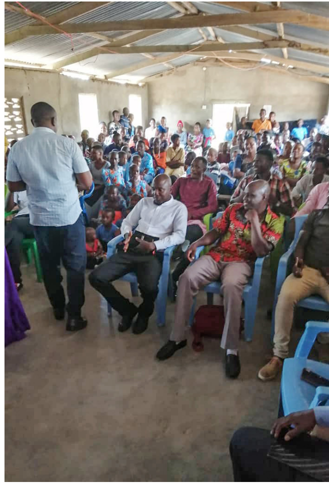
Mission among children and youth in Tanzania April 2024