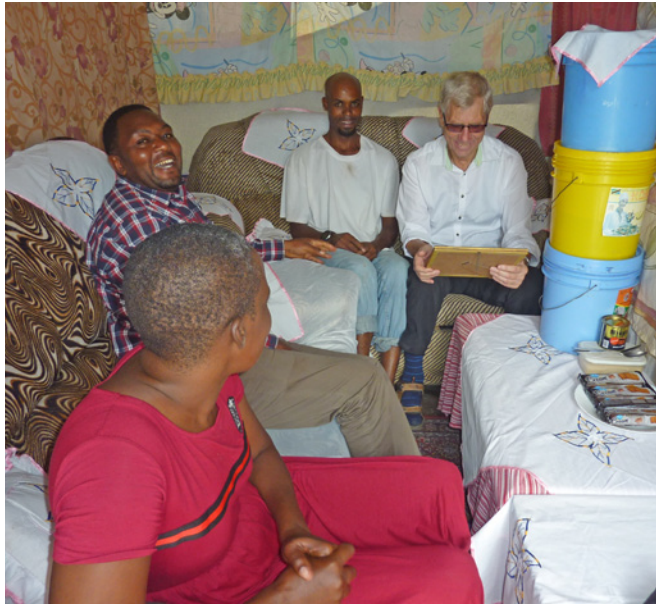
then a small table. Before we went into the house, we had to agree on where to sit, and then we went in one at the time. There was no space to walk around. In the bedroom there was only room for a double bed where they all slept. The partition between the bedroom and the living room was made of an old sheet.

When we saw the house where they live, we got another shock. It was made of tent cloth, and the roof consisted of tin plates. There was not much space as the house only measured approx. 3 \times 3.5 meters. See the picture of their living room: there can be a two-person sofa on one side and the same along the wall and